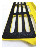
Upper Load-Bearing Approach Plate with Rubber Backing