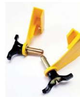
Quick Connect Pins